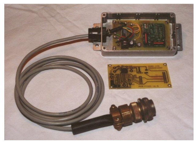
Magnetic Compass for automatic antenna alignment

The coordinates of the receiving station and the orientation of the station are inserted automatically or manually, using data-entry during the installation of the system.