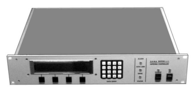
Antenna Control Unit (ACU): front view

The positioning of the illuminator has been optimized so as to achieve a diagram, in the vertical plane, of cosecant square type (csc2).