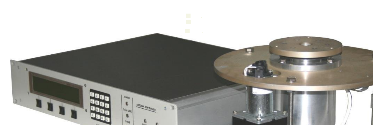
Aviolink: Antenna Control Unit (ACU) and Azimuth Positioner assembly